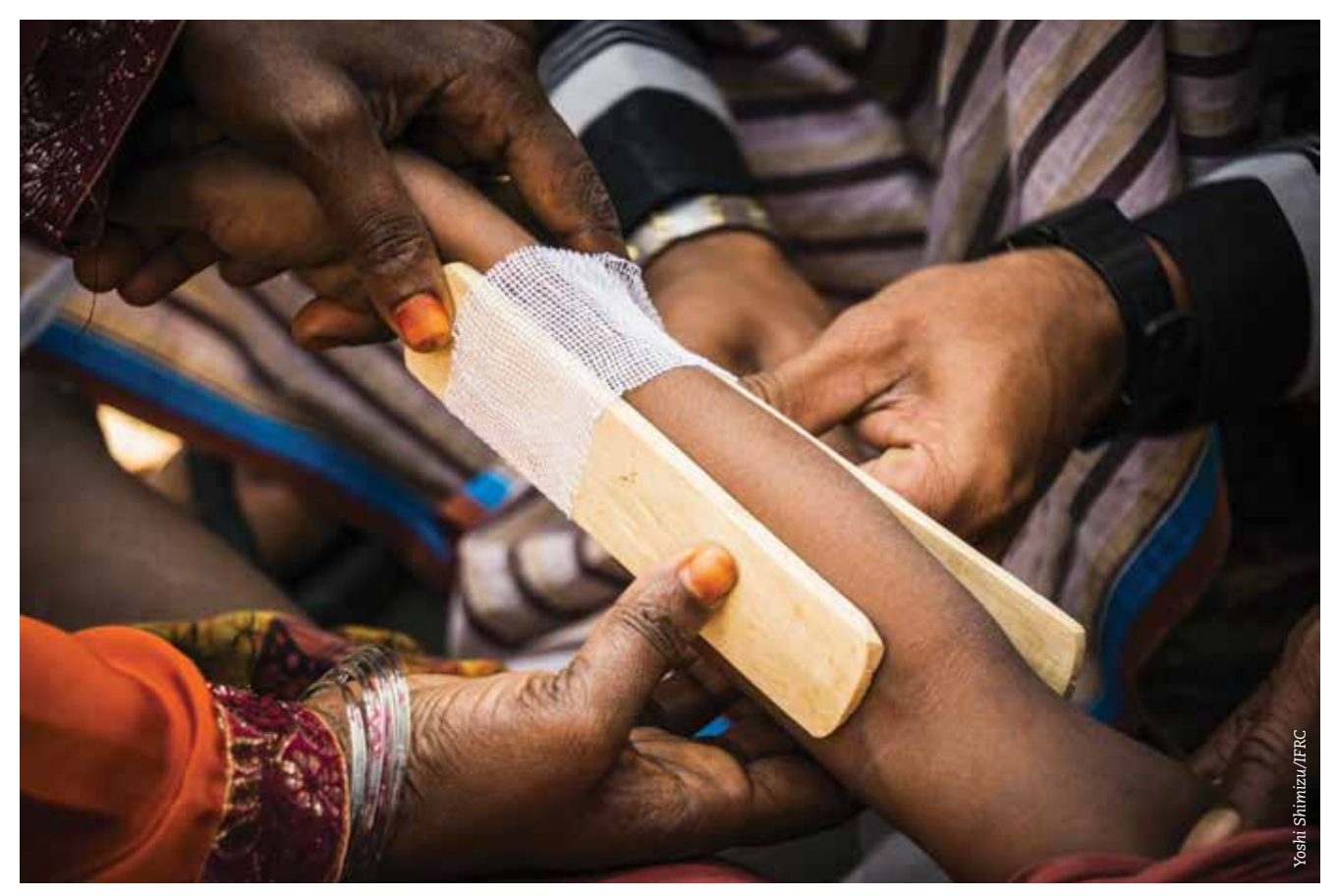
Bangladesh, Dhalchar. Every year thousands of lives are saved by Red Cross Red Crescent in cyclone-prone Bangladesh. Thanks to cyclone shelters and early warning systems by which volunteers sound the alarm, evacuate and assist with First Aid, vital assistance reach people in need.